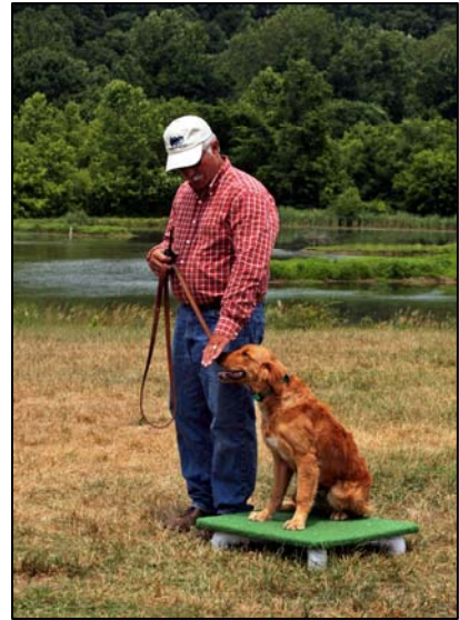
Give your signal before stepping off.

If he does get off the place board, use your leash or line to replace him. It is important that you return your dog to the same place and that he be seated facing the same direction as before he broke the stay. Tap to start him back and once again when he is on the spot.