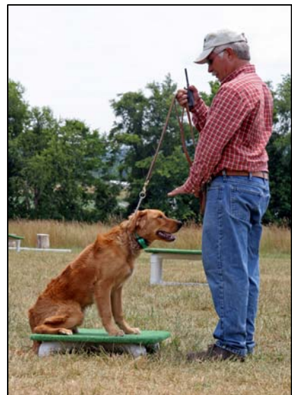
Hold your stay signal in position in front for the first two days.

Count to 15 and then reverse direction. Step back on your right foot and when you are again in a heeling position, lower your left hand, followed by your right. After a short pause, praise your dog for this first stay. If he breaks from position — taking your return, the relaxing of the leash, or your praise as a signal that his job is over — tap on “Sit”.