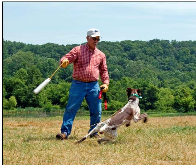
Buddie loves to retrieve!

Retriever trainers call these reward retrieves “fun bumpers.” Fun bumpers help maintain a good training attitude and keep dogs interested in obedience work.